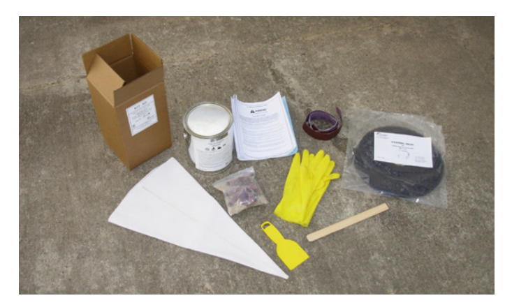
With our adhesive kits (Kit-AD), a permanent watertight connection has never been easier.

Each sump section is manufactured with an EZ-Fit adhesive channel which has enough room for the adjoining sump component and our adhesive mix which seals and hardens, creating a permanent joint. This new joint is leak free and watertight. The two part design eliminates the need to perform a confined space entry on deeper burials.