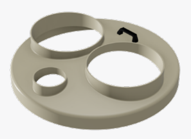
Fill/Vapor Lid with 15 in. access openings and 6 in. observation port