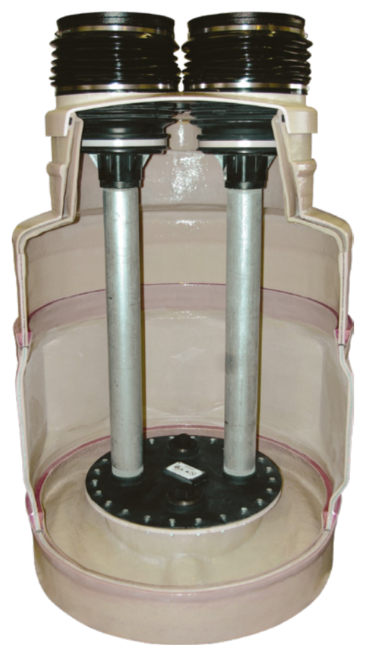
Fill/Vapor lids come in two popular cuff sizes and include an observation port as a standard feature.

On hydrostatic double-wall models, the enclosure top includes a built in reservoir which houses a sensor for electronic monitoring.