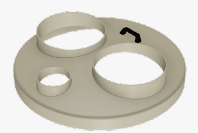
Fill/Vapor Lid with 13 in. occess openings and 6 in. observation port