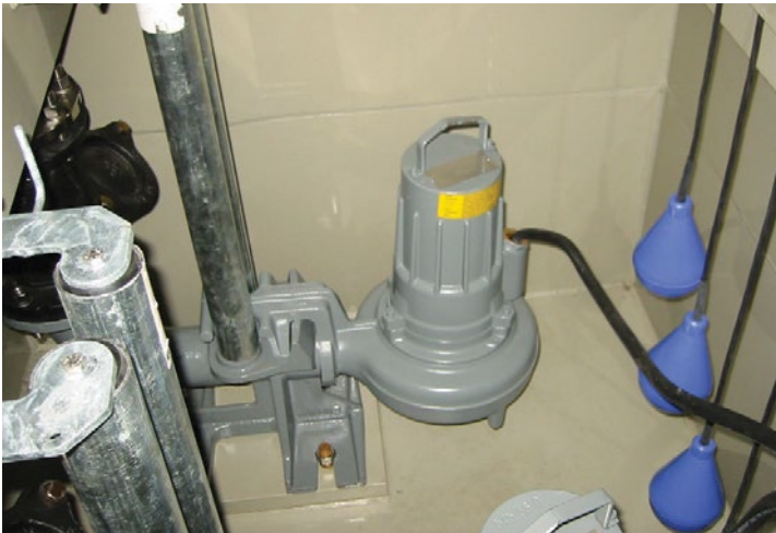
Factory installed pumps and controls