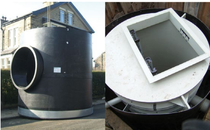
Prefabricated pumping station with optional shuttering to accept concrete pour