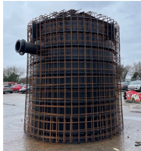
Pumping station supplied with optional factory fitted rebar reinforcement