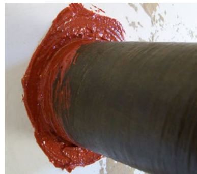
Figure 5 Brush away excess adhesive inside the sump