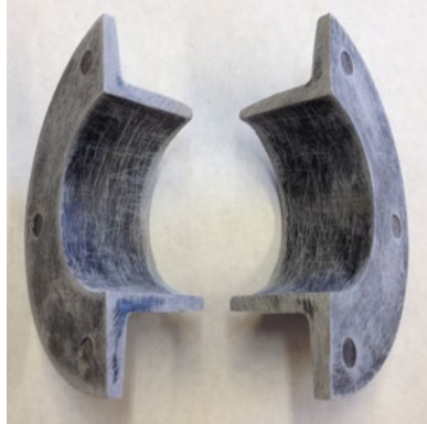
Figure 2 Split Sump Entry Fitting sanded surface