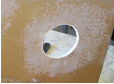
Figure 1 Sump wall sanded surface