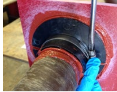
Figure 4 Split Sump Entry Fitting installation

NOTE: A continuous adhesive bead is essential for the Split Sump Entry Fitting to have a properly bonded joint. If there is an area that does not have an adequate bead of adhesive around it, apply extra adhesive in this area. On curved sumps there will be a large gap between each side of the Split Sump Entry Fitting and the sump wall which must be filled with adhesive.