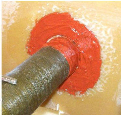
Figure 3 Apply adhesive to sanded areas of pipe or conduit