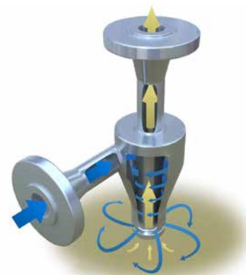
Figure: Tore fluidizer, used to remove solids from the ToreTrap vessel and upstream separators.