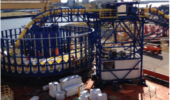
Basket\ carousel\ loading\ with\ various\ diameter\ flexible\ pipes.\ Loading\ tensioner\ creates\ catenary\ at\ both\ carousel\ and\ shore.