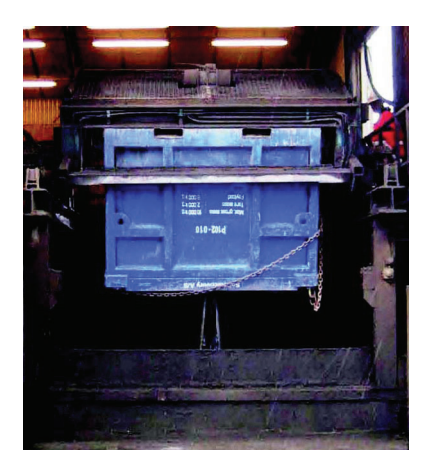
Shaking motion ensures full discharge of cuttings from skip