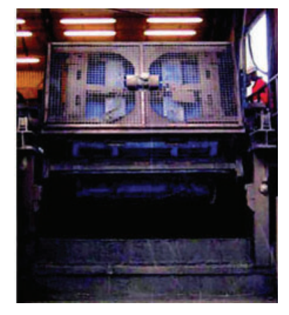
Turntable rotates to full discharge position