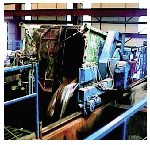
Cuttings Skips Turner