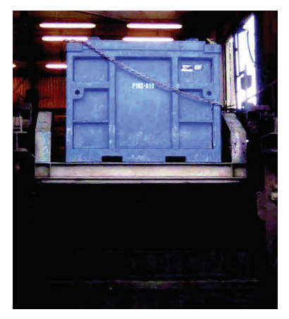
Cuttings Skip positioned on turntable