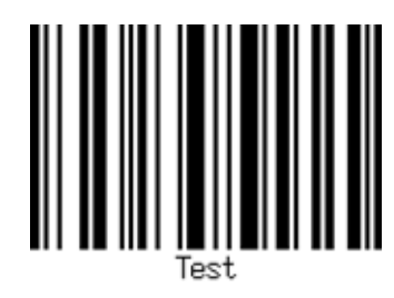
Figure 2: Code 128 sample