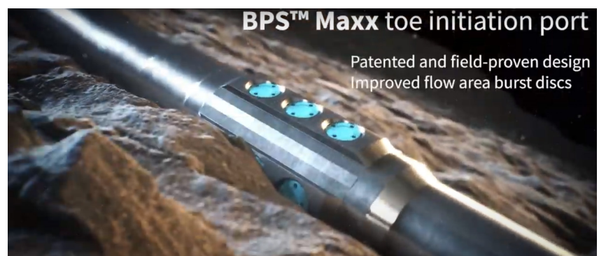
Figure 6. BPS Maxx.