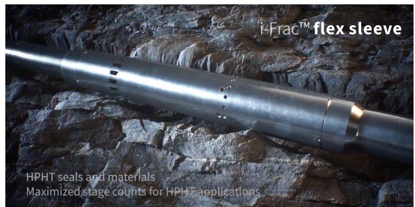
Figure 4. i-Frac flex sleeve.

Stimulation requires reliable frac sleeves. The i-Frac™ flex sleeve (Figure 4) is a ball-drop-activated multi-stage fracturing sleeve for openhole or cemented completions. Multiple stages can be installed in a wellbore, with each stage containing between 1 to 20 sliding sleeves for optimised fracture design. This allows operational and stimulation flexibility for single- or multiple-point limited-entry openhole assemblies. For each stage, one ball is pumped from the surface to open all sleeves in