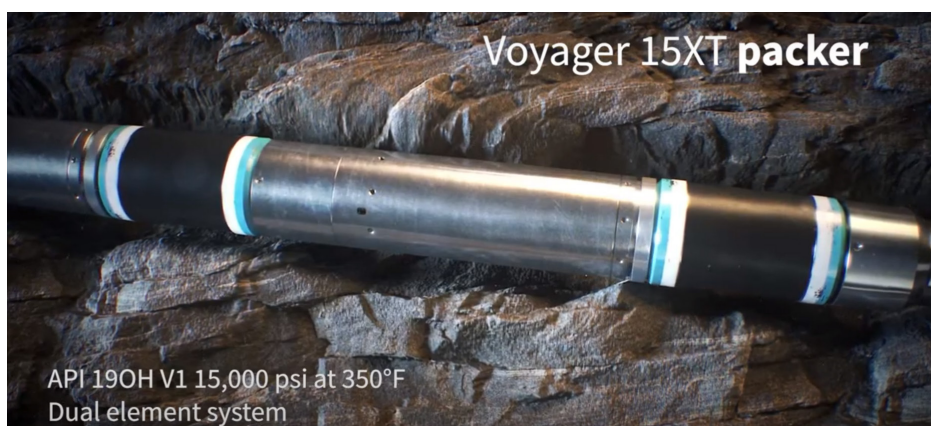
Figure 1. Voyager 15XT OH packer.