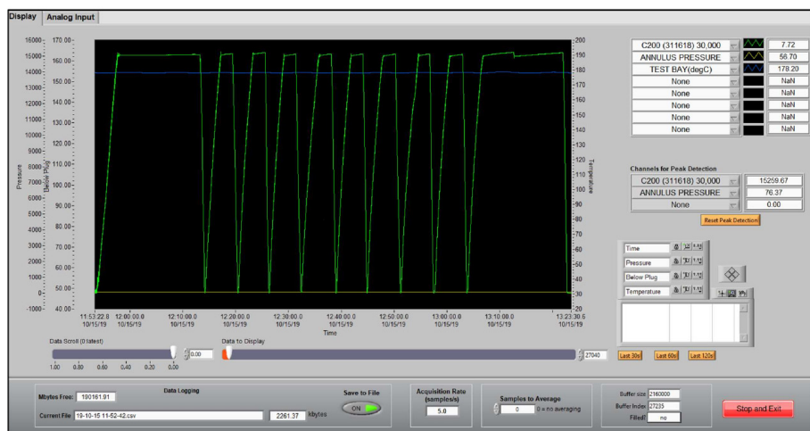
Figure 2. Frac simulation test: cycle test, 10 times at 350°F (177°C).