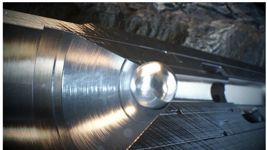
Figure 5. Flow Lock Sub.