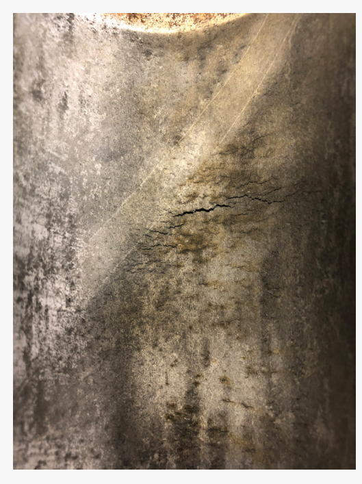
With presence of pitting throughout the coiled tubing's ID surface, the test sample still surpassed 100% predicted fatigue life.