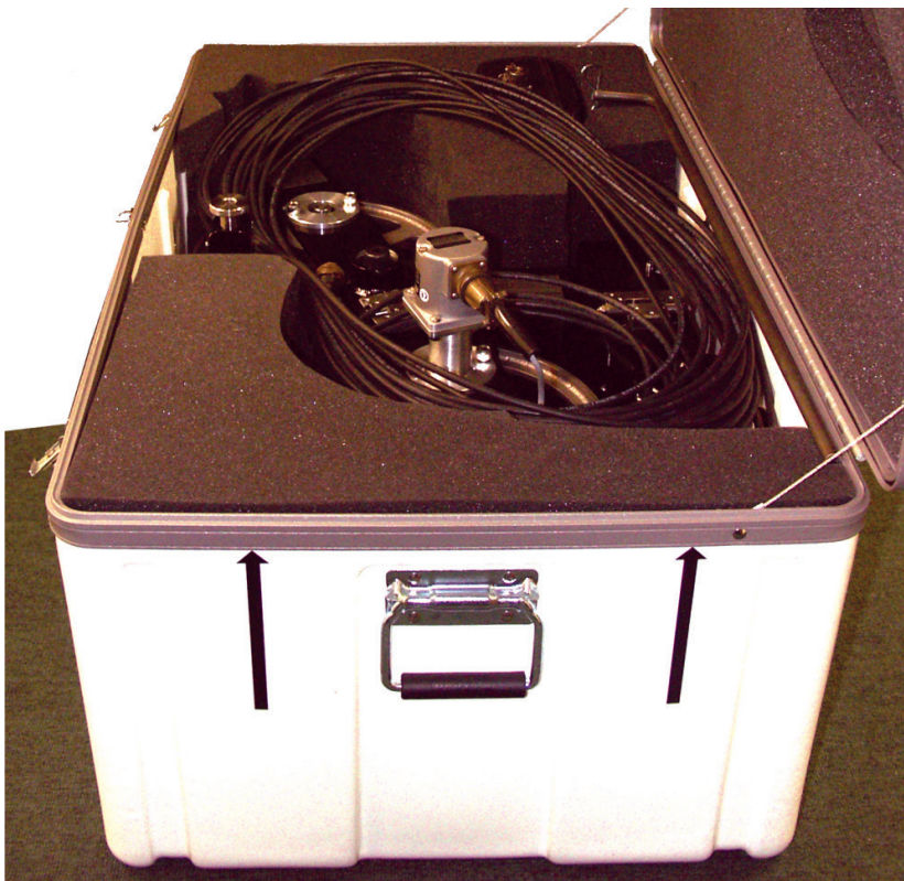
A padded storage box is provided for DMS transport and storage.