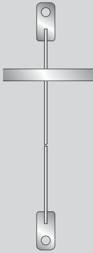
Test Rod for BOPs