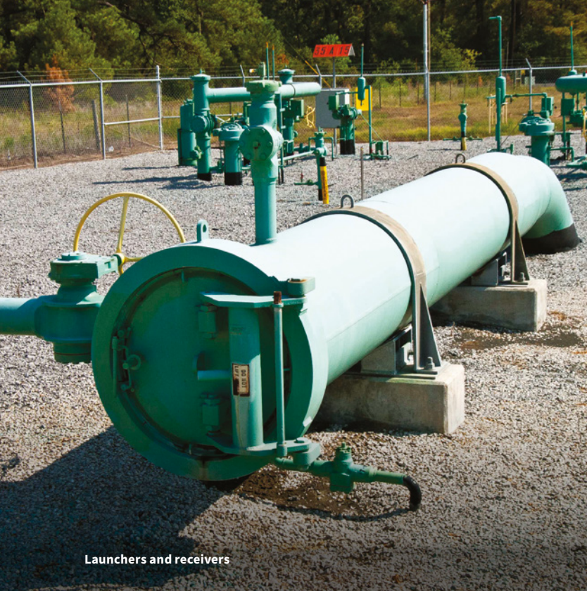
Launchers and receivers