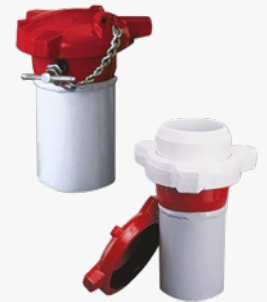
Conversion: closure to figure 505 pipeline union