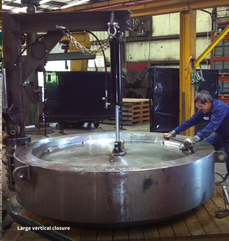
Large vertical closure