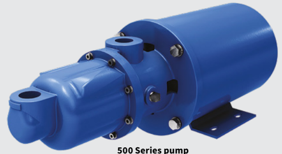
500 Series pump