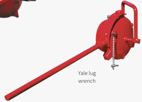
Yale lug wrench