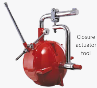
Closure actuator tool

An additional safety feature — a pressure warning device is furnished as standard equipment on all 6 in. and larger closures and may be purchased as an option on smaller sizes. Before the cap can be rotated, the seating screw must be removed from the pressure warning device body. This action will warn the operator of any residual pressure in the vessel before the closure cap is loosened. The pressure warning device is not designed to release internal pressure.