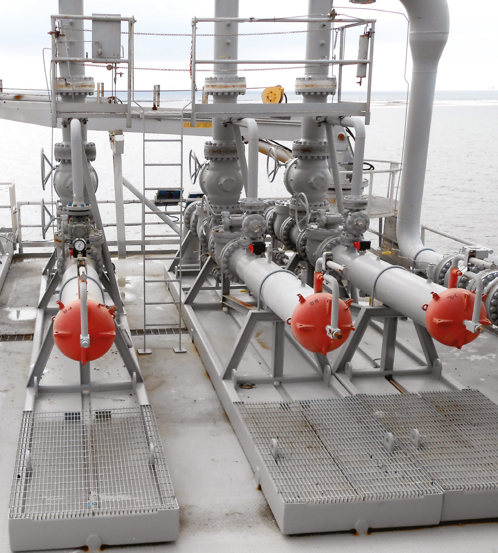
Typical Yale application