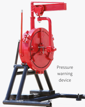
Pressure warning device