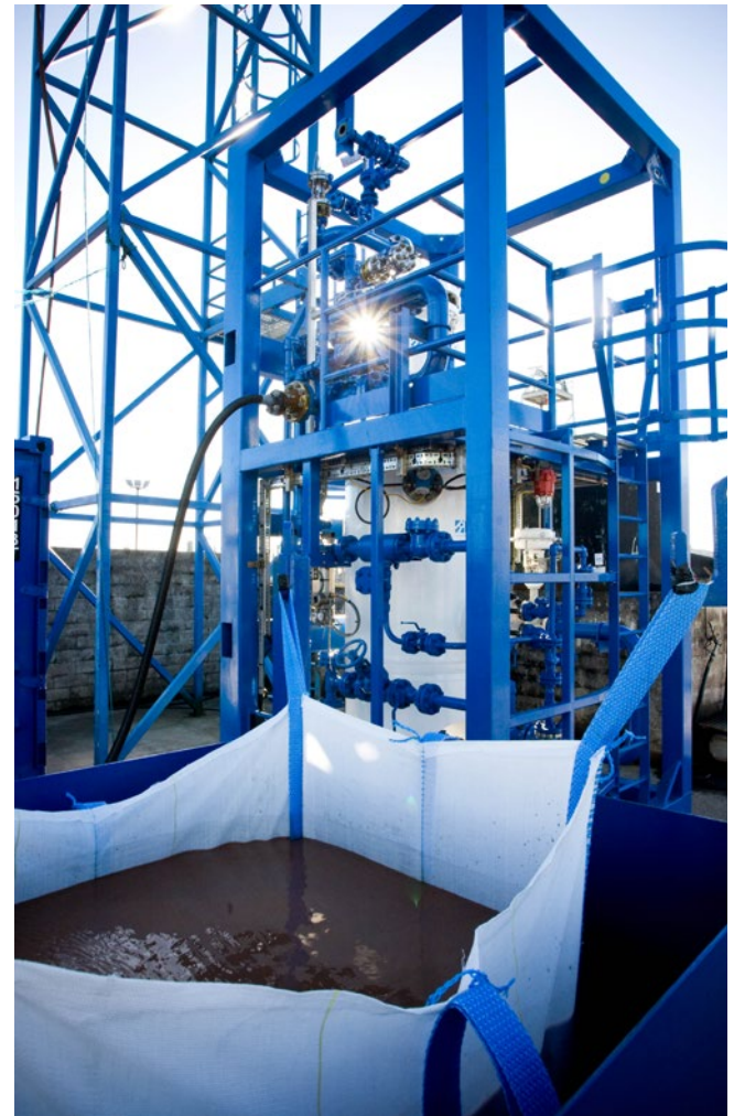
Figure: NOV ToreScrub rental unit for temporary vessel desanding