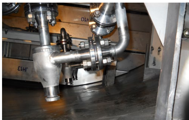
Figure: ToreOVD installed in a separator for connection to a ToreScrub