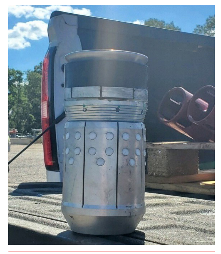
Figure 2. Multiple VapR frac plugs deployed in a well in the Appalachian Basin.