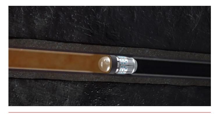
Figure 3. The VapR dissolvable frac plug's design, downhole performance during frac treatment and customisable material provide a solution to frac plug issues.

ease of deployment, pump-down maximisation, pressure and mechanical resistance, and dissolvability, rather than a product that focuses solely on material selection. The VapR incorporates each of these metrics and provides strong operational performance while allowing significant dissolution improvements over previous generations of dissolvable frac plugs.