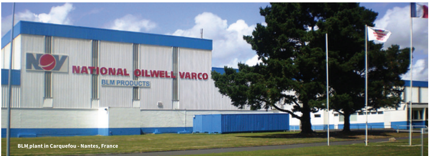
BLM plant in Carquefou - Nantes, France