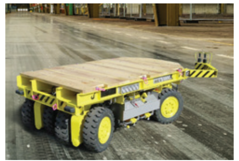
Load transfer transportation trolleys