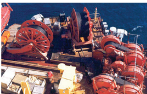
Double combined wire rope/chain mooring winch/windlass

These systems can be adapted to any chain size and wire diameter. More than 30 rigs have been equipped with a solution manufactured at our plant.