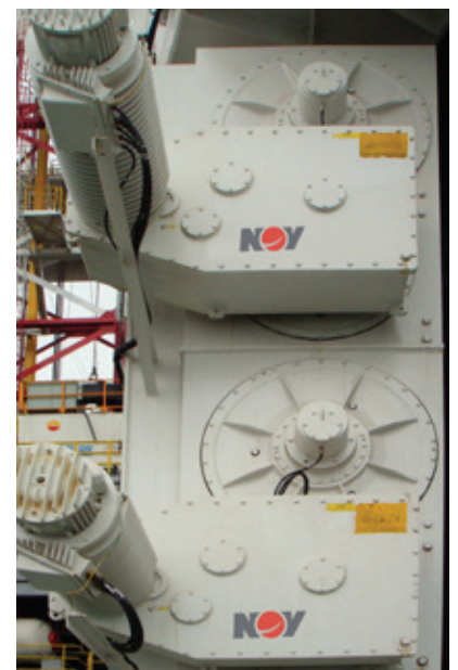
BLM Jacking Units Vertical D Series