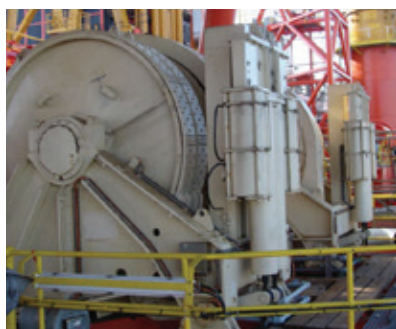
Double combined wire rope winch