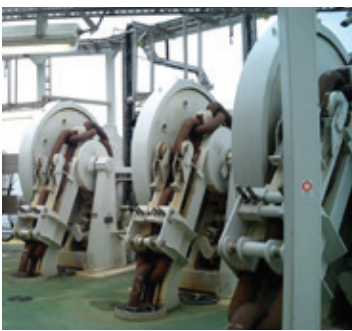
Electric chain tensioner