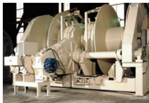
Double configured windlass with chain