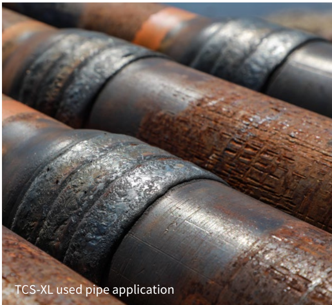
TCS-XL used pipe application

For ultimate upset protection of new and used completion tubing, no other casing friendly hardband offers more durability for work strings. A maximum of one (1) band is applied to both box and pin upset near the taper. This application allows future re-cuts, therefore extending the life of the string.