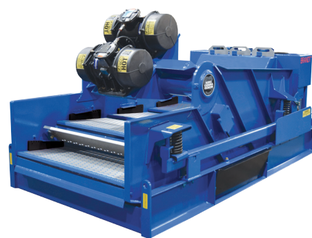
KING COBRA VENOM Shaker with CONSTANT-G CONTROL

VENOM screens eliminate the need for crown rubbers and offer improved solids conveyance and fluid throughput. A rugged and reliable screen wedge system is used to secure the screens. A pneumatic single point deck angle adjustment is a standard feature.