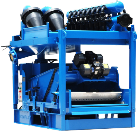
COBRA 16/2 Mud Conditioner