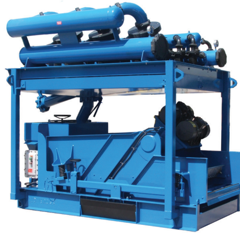
KING COBRA 24/3 Mud Conditioner

COBRA and KING COBRA Mud Conditioners utilize a combination of hydrocyclones and a COBRA or KING COBRA shale shaker to separate solids from liquid. The combination of hydrocyclone cones utilized is dependent upon the specific application of duty. Cone combinations typically consist of desander cones (10-inch or 12-inch) and desilter cones (4-inch), which are properly sized to handle over 125% of the flow rate.