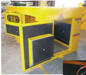
Sound Proofed Housing