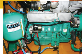
Oil Maintainer and Wrapped Exhaust