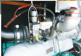
AMOT - Rig Saver