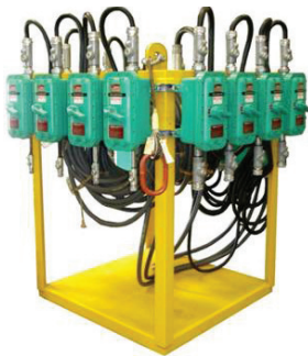
Explosion Proof and Rain Tight Distribution Rack