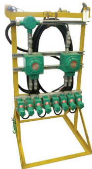
Explosion Proof and Rain Tight Receptacle Rack