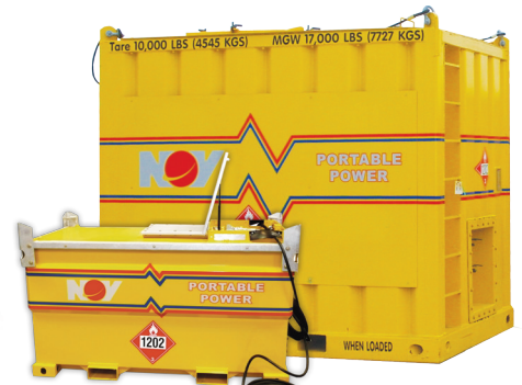
528 gal to 2,350 gal Dual Wall Fuel Tanks