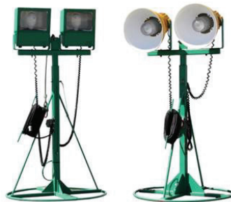
Explosion Proof and Rain Tight Lighting